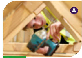
Carpentry & Joinery